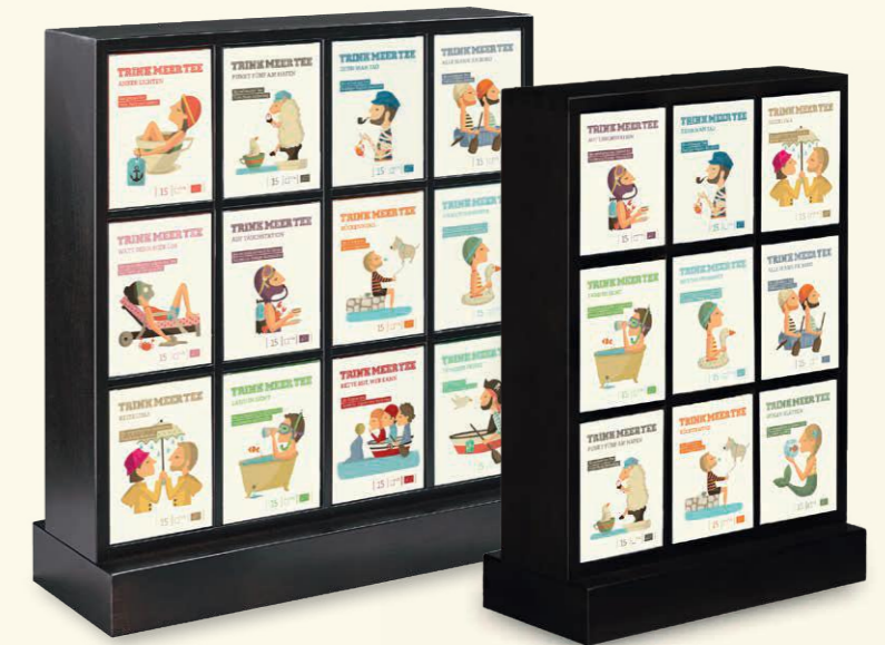
DISPLAY FOR TEA POUCHES You have the possibility to choose from three different displays: A dark wooden display for nine or for twelve teas, or our metal display, which holds nine boxes.