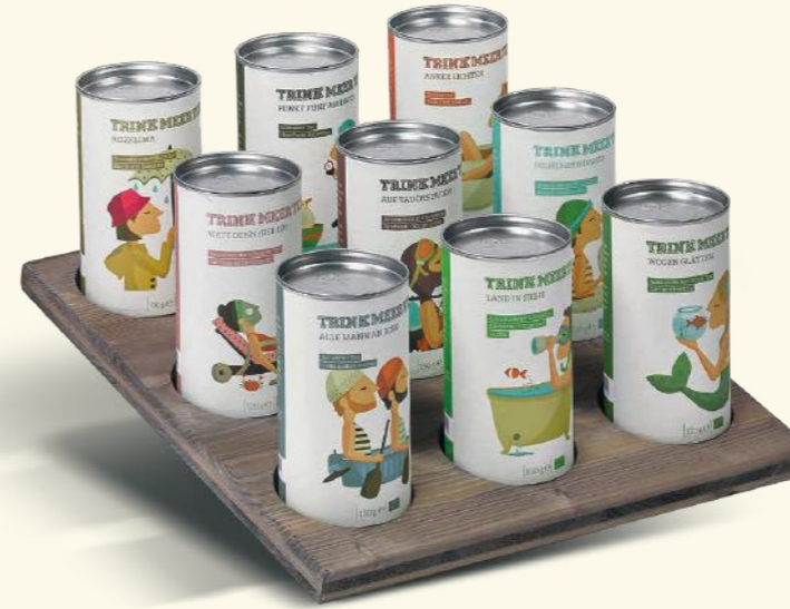
DISPLAY FOR LOOSE TEA Our handcrafted wooden display offers the opportunity to showcase nine tea tins optimally.